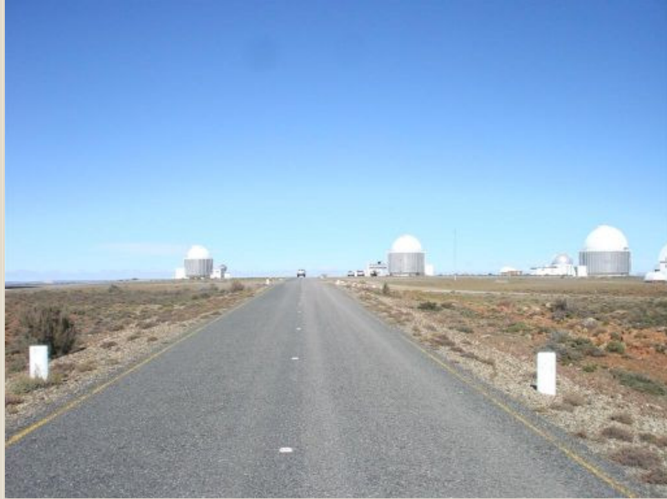
Photo: Many other conventional Telescopes