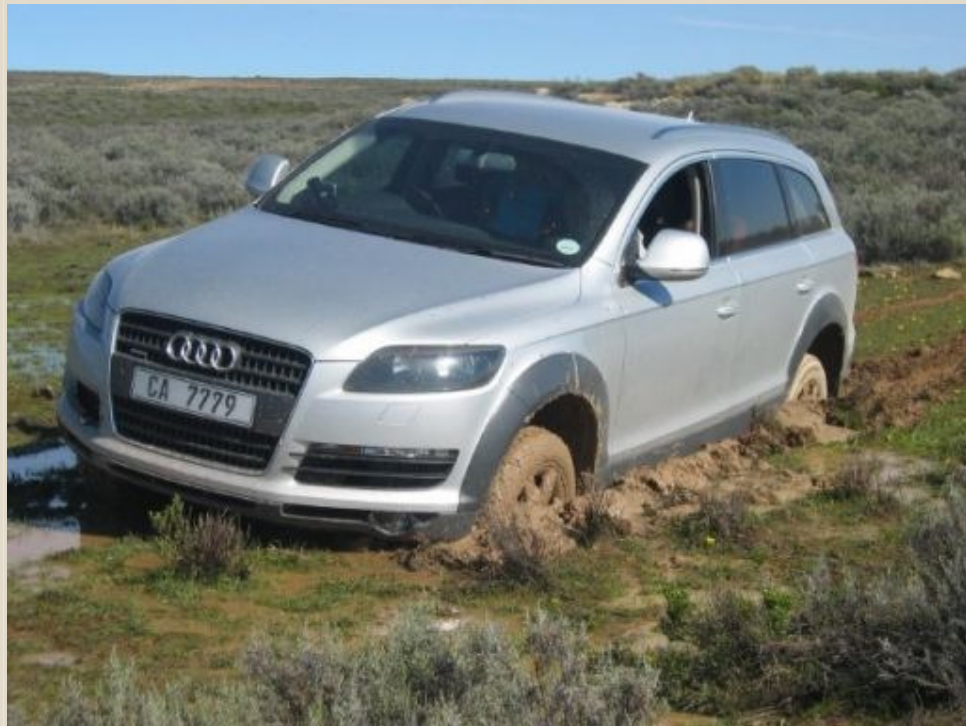
Photo: Q7 sucks like a leach.