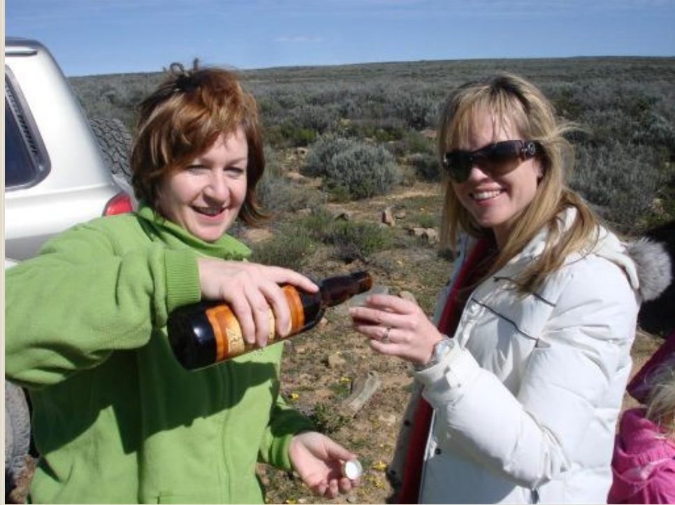
Photo: The ladies decide to make the best of it.