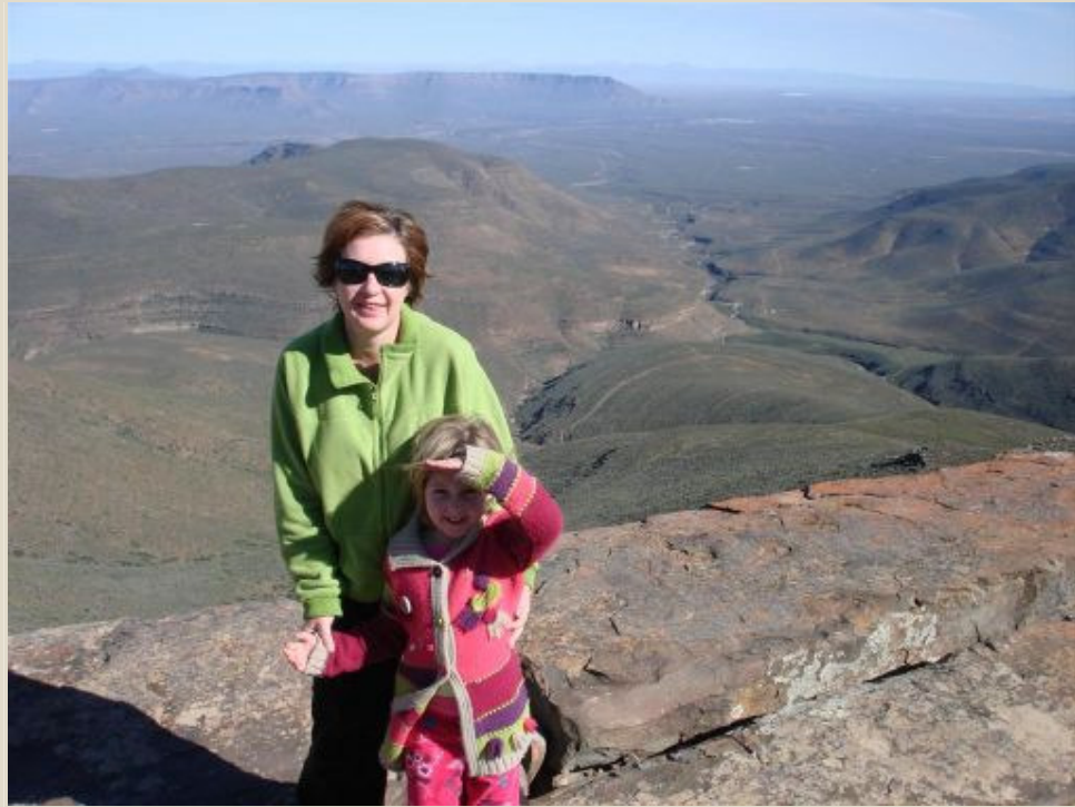
Photo: View Point at Blesfontein