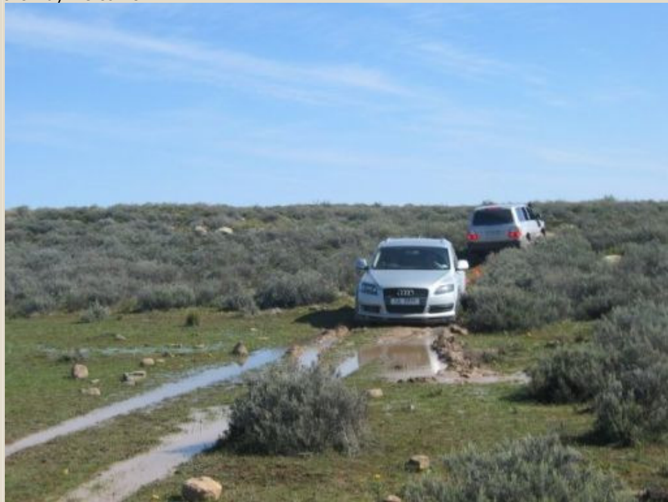
Photo: The Q7 is free at last and has to take the long road back.