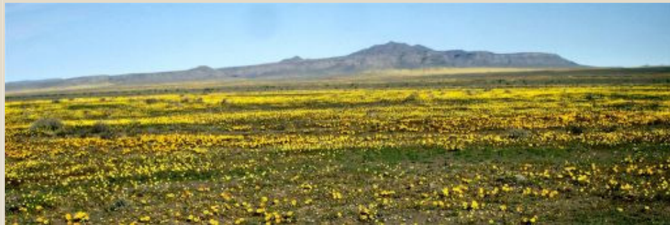
Photo: Spectacular fields of flowers.

We finally head to Ceres for a bite and then back home. I can highly recommend this trip!