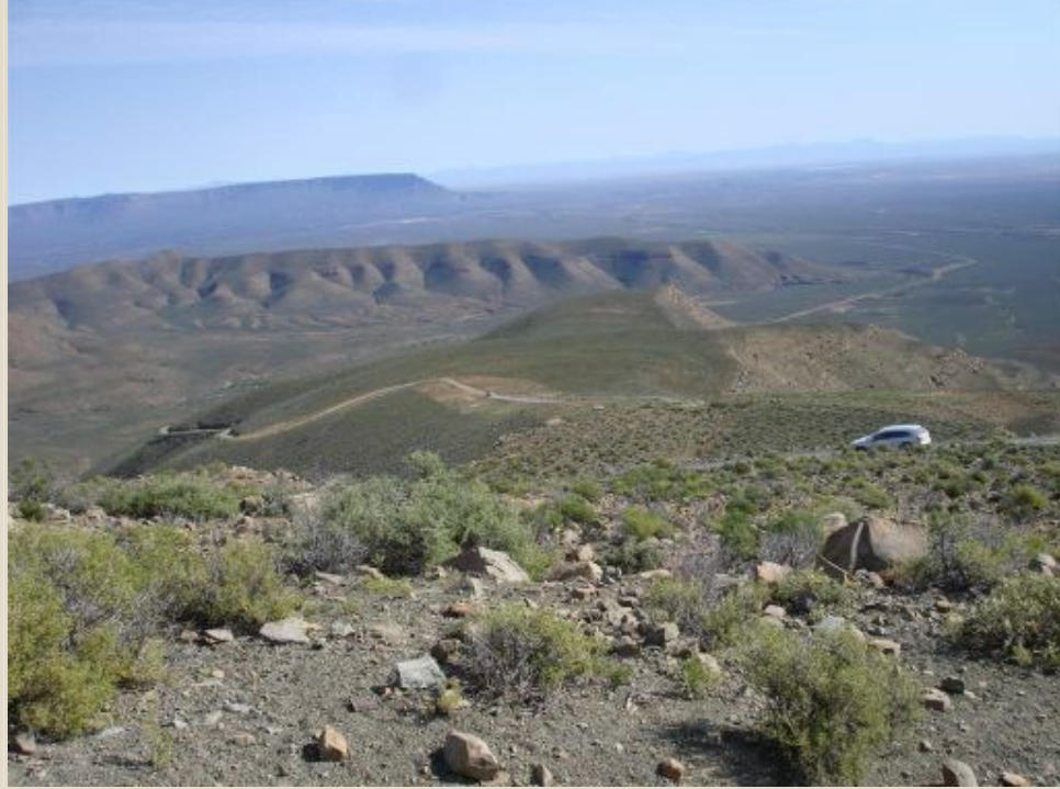
Photo: View from the top of Ouberg Pass

Next we head down the Ouberg Pass, which has spectacular views – even more spectacular are my wife’s, blood-drained knuckles as we descend towards the Tankwa.