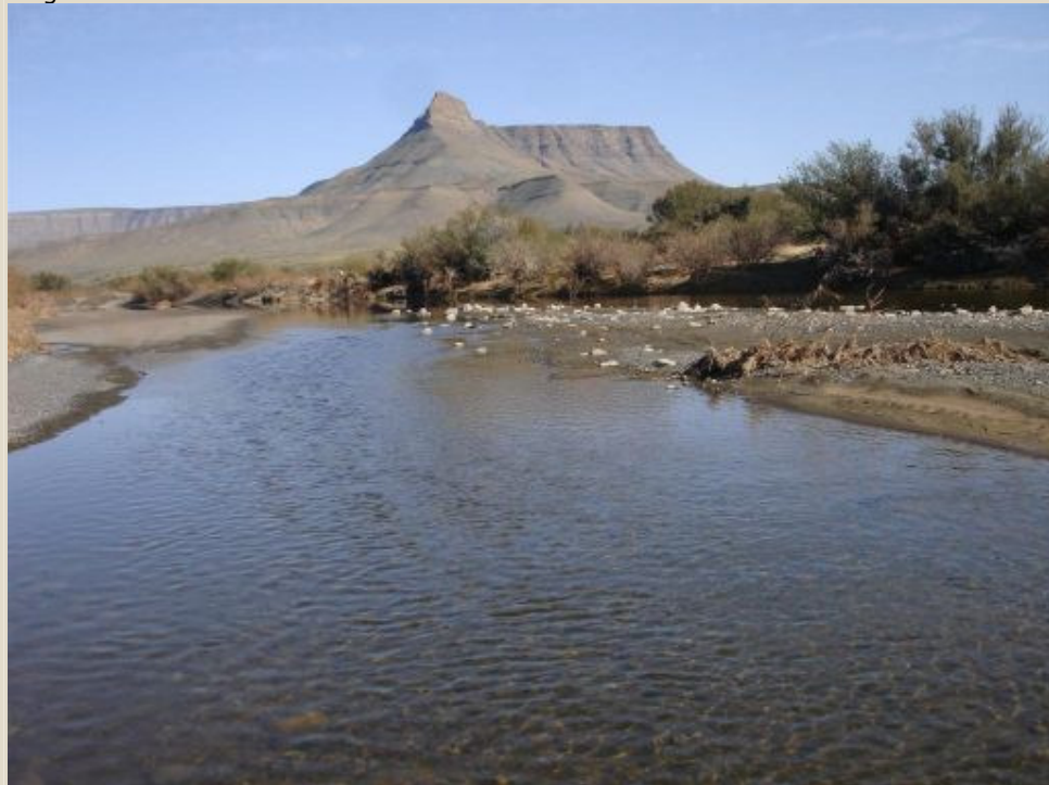
Photo: Crossing the Tankwa River

We are greeted in the Tankwa by carpets of yellow and orange flowers. Quite magnificent!