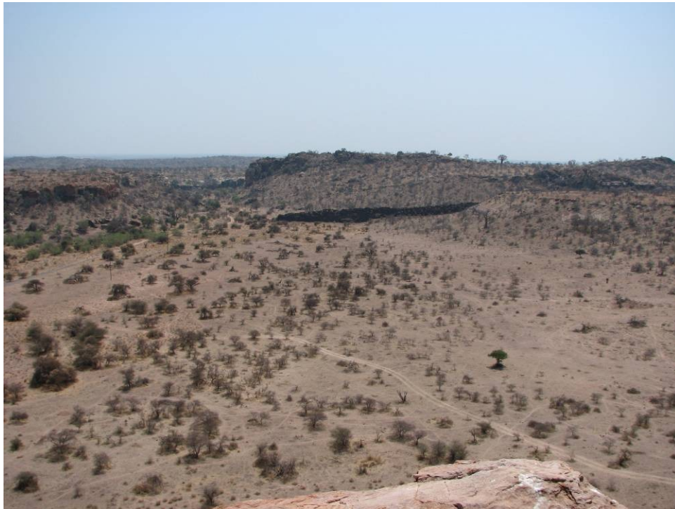
Volcanic Dyke in the distance